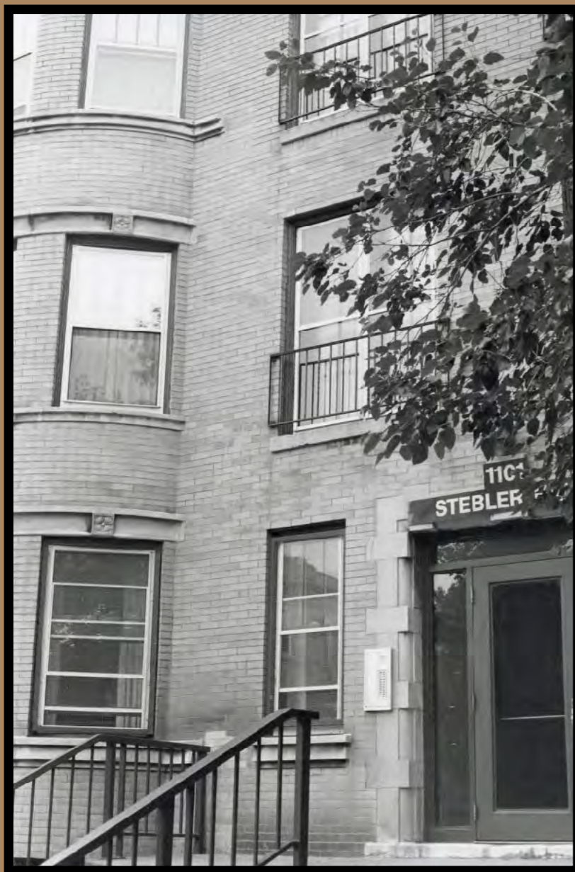
THE LCLC OPENED IN STEBLER HALL IN 1992.

skill levels have been explored by our students with grace and diligence.